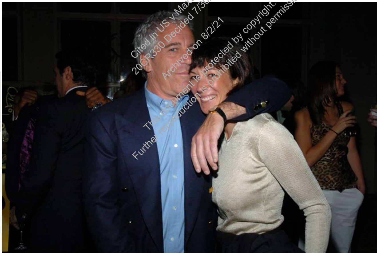
FILE - Jeffrey Epstein and Ghislaine Maxwell are pictured at Cipriani Wall Street on March 15, 2005 in New York City.

Maxwell pleaded not guilty to a new charge of sex trafficking a minor in the early 2000s. The British socialite is fighting with prosecutors on multiple fronts — though they were not addressed during the brief hearing.