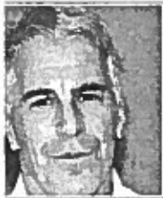
Jeffrey Epstein (gov)

Five attorneys for two girls who contend they were assaulted by billionaire and convicted sex offender Jeffrey Epstein filed court papers on Monday claiming the U.S. Attorney's office violated the Crime Victims' Rights Act by signing a nonprosecution agreement with Epstein without notifying them, the Palm Beach Daily News reported.